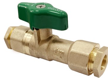
elson NON-RETURN ISOLATING VALVE INVERTED FLARE LF DR BRASS