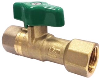
elson NON-RETURN ISOLATING VALVE LF DR BRASS

Code: 76020 Rp 1/2 x Rp 1/2 Code: 76022 Rp 3/4 x Rp 3/4