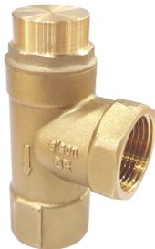
elson PRESSURE REDUCTION VALVE RIGHT ANGLE LF DR BRASS