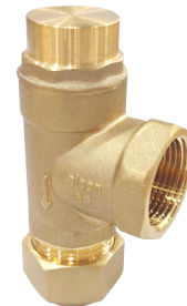
elson PRESSURE REDUCTION VALVE RIGHT ANGLE C/OLIVE LF DR BRASS