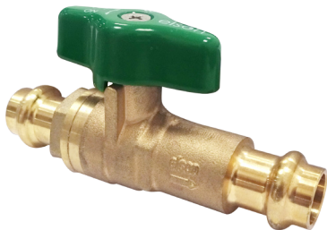
elson NON-RETURN ISOLATING VALVE PRESS LF DR BRASS